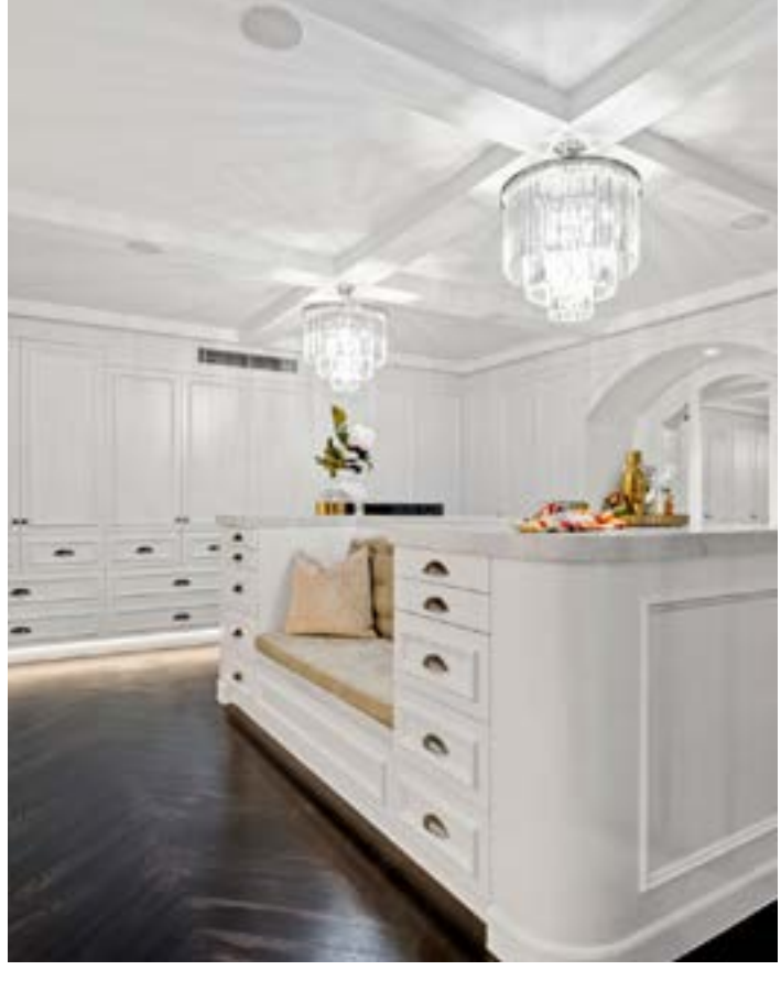
Clever integration of lighting and window treatments creat beautiful lit spaces throughout the home.