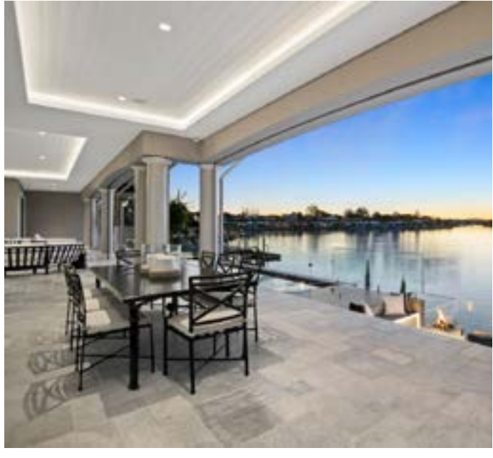
Exterior motorise blinds allow the sun to be mitigated while also providing a barrier for unwanted flies and bugs.

Although situated in the prestigious gated community of Sanctuary Cove, the client stressed the importance of security, but desired it to be implemented subtly. Cameras are strategically placed both indoors and outdoors. Traditional security keypads have been largely replaced with panic button switches, an app for smartphone control,