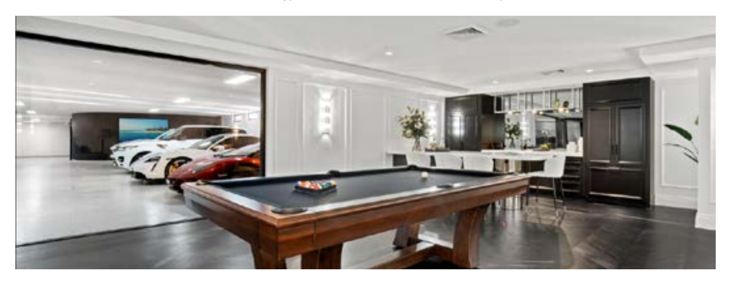
As the 20-car pillarless basement had no dropped ceiling the integrators had to run multiple bundles of cables through the slab.

Bridger Automation's Triple Award-Winning Integration Technology Sets Course for the Next Century